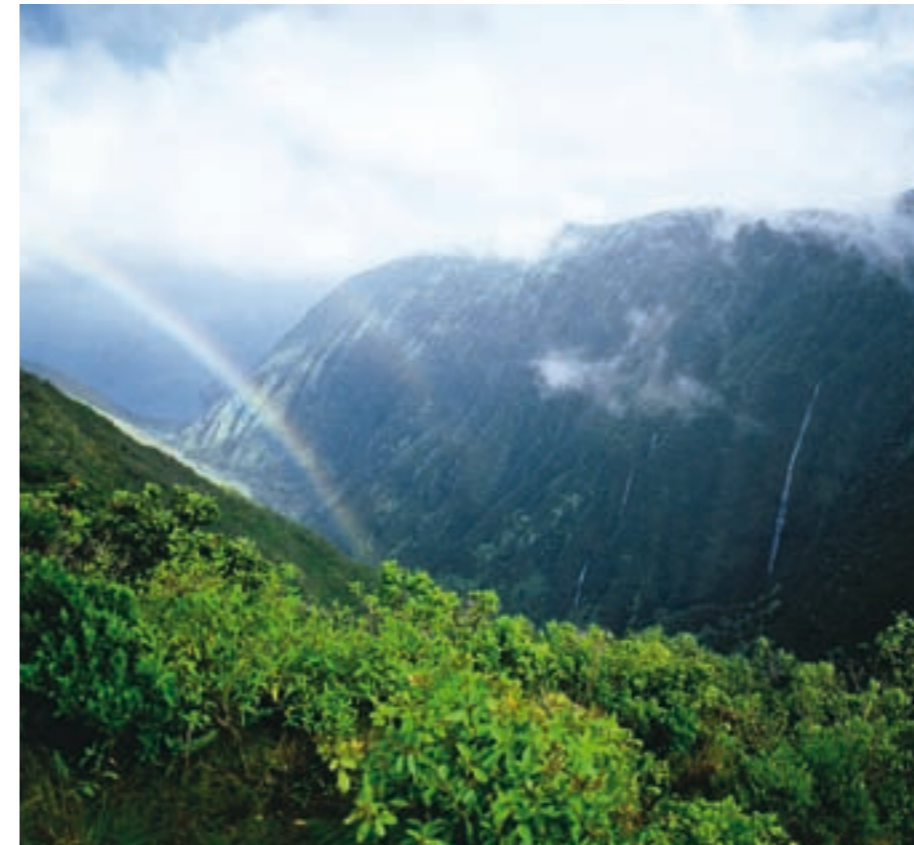
HALAWA VALLEY